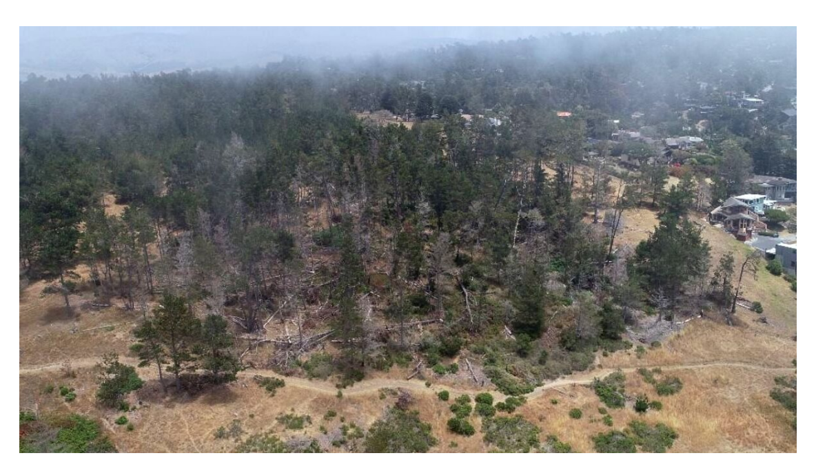
July 8, 2021