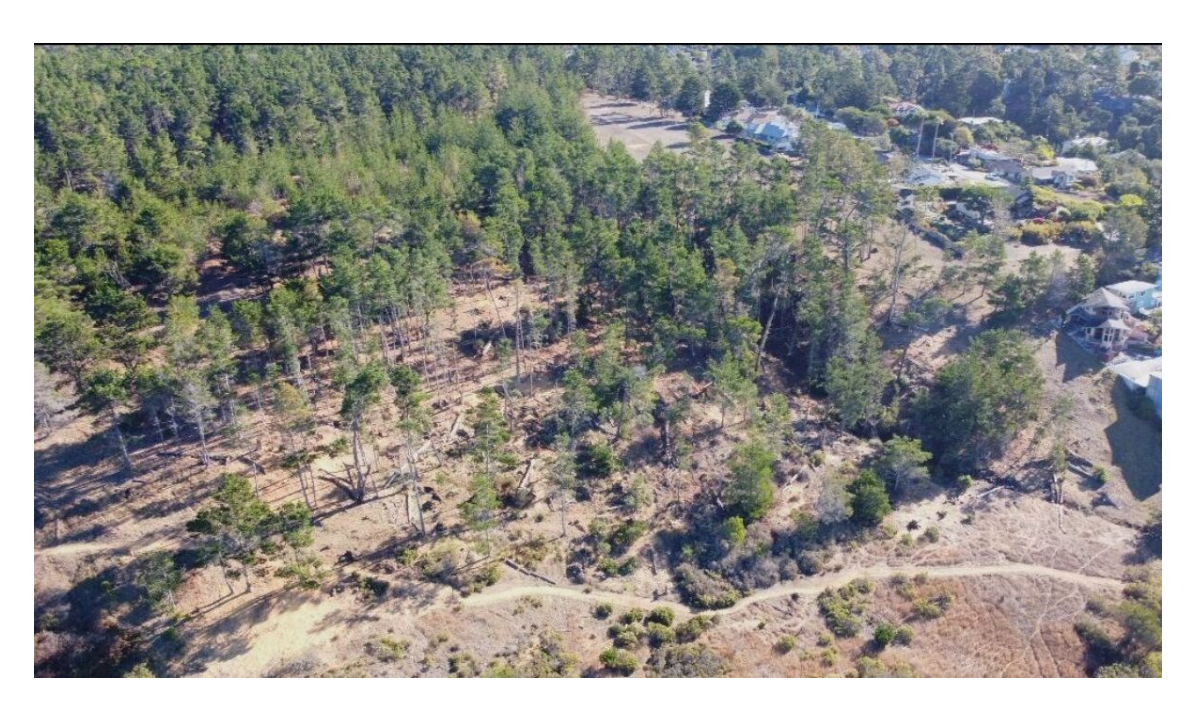
October 27, 2021